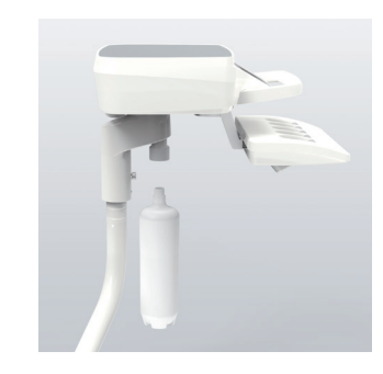
Water bottle Option

Clean water is easily accessible for handpieces and the cupfiller via a water bottle that's conveniently located and secured immediately under the doctor table.