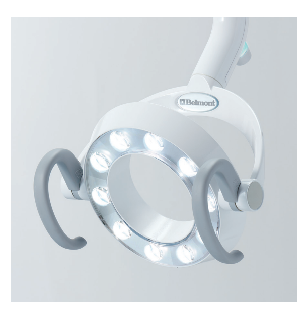
900 DENTAL LIGHT

Our lighting fixtures are designed to reproduce natural light with a high functional colour rendering capacity. The light's composite mode can be active, and the light can be turned on and off, via its touch-less sensor.