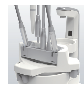
Flushing system Option The handpiece flushing system inhibits biofilm build up and bacterial growth in the handpieces hoses.

The lens cover and autoclavable light handles are effortlessly removed with a single lever action for easy cleaning.